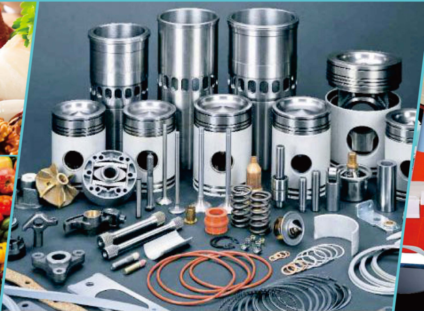
DECK & ENGINE STORE