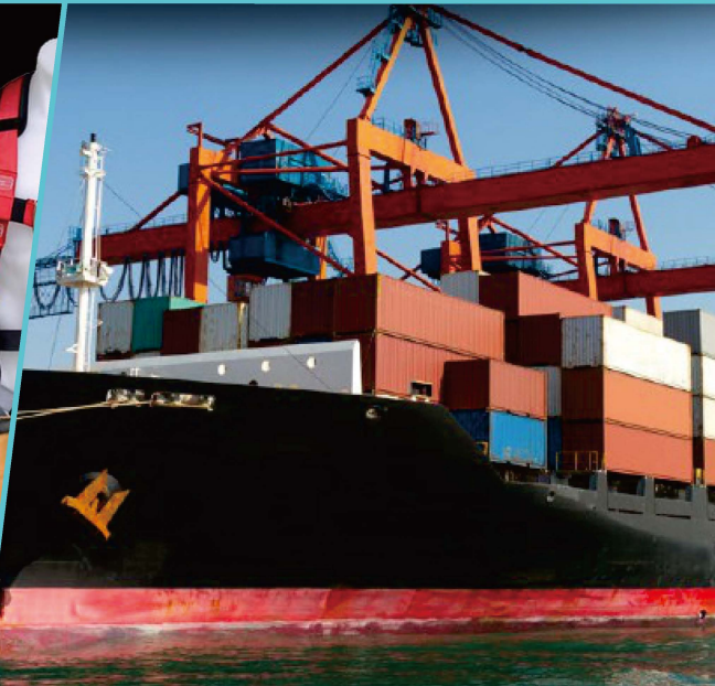
GENERAL SHIP SUPPLIES